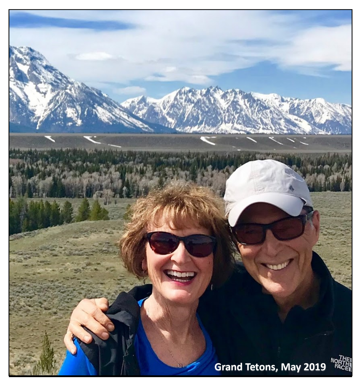
St. Dunstan's Episcopal Church

28005 Robinson Canyon Road, Carmel, California 93923 (831) 624-6646 office(at)stdcv.org