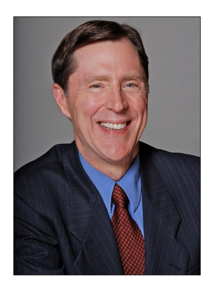
St. Dunstan's Episcopal Church December 14, 2019 2 o'clock

Give rest, O Christ, to your servant with your saints, where sorrow and pain are no more, neither sighing, but life everlasting.