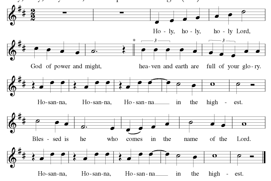
The people stand or kneel.